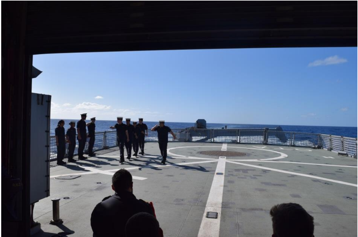
Port Watch conduct a march past on the flight deck for the reviewing officer SLT Mara, RNZN while onlookers enjoy the shade in the hangar.