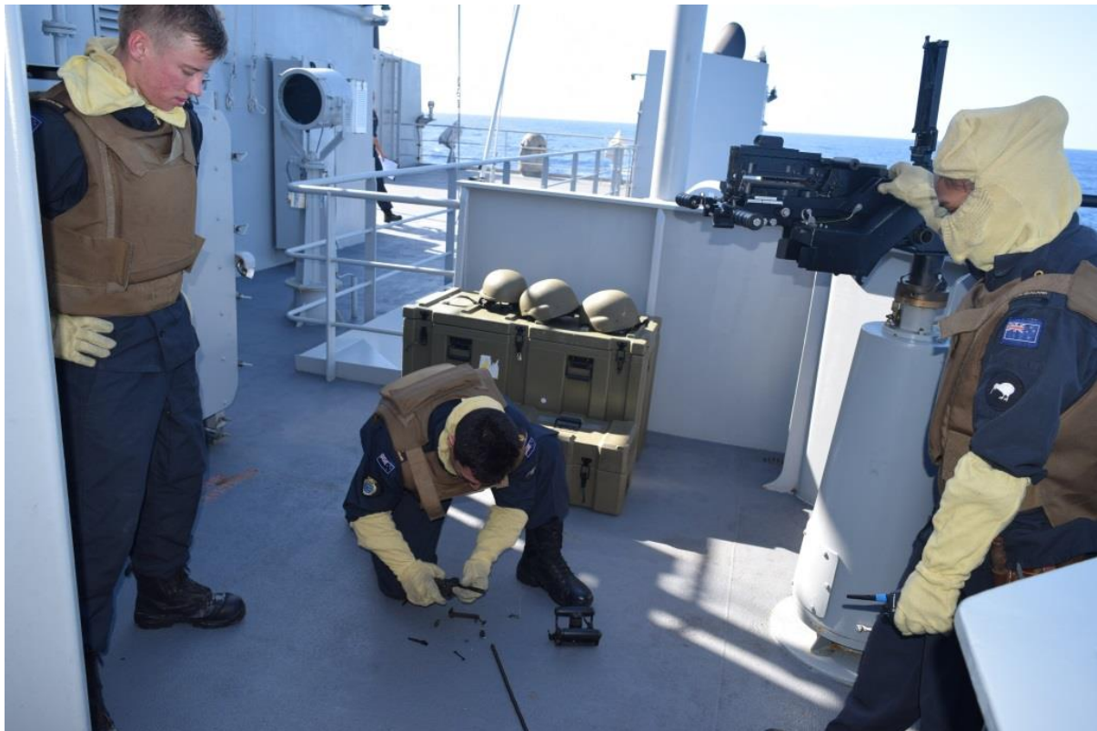
Port Watch conduct a firing pin change of G2 during the seamanship excellence challenge