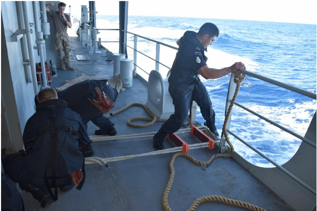
Port Watch race to be the first to report “ready to receive seaboard” as part of the seamanship excellence challenge.